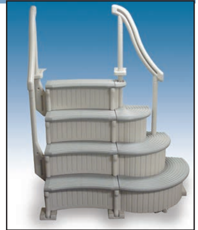
Above Ground Curve System