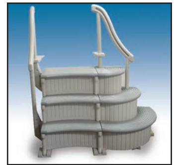
In-Ground Curve System