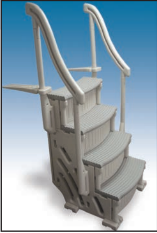
Above Ground Stair Case