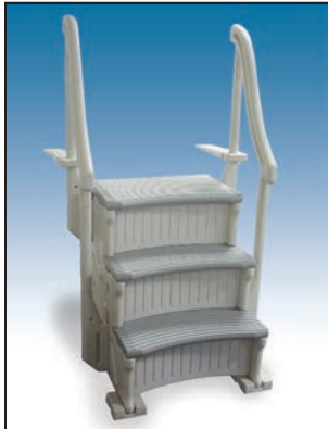
In-Ground Stair Case